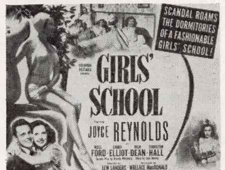
22 x 28 SLIDE (Same Design)